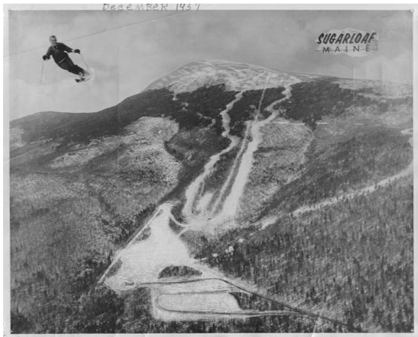
Photo of Sugarloaf taken in December of 57 on what would be a record snowfall season. Tbars 1, 2 and 3 are present along with Narrow Gauge, Sluice, Winters Way and Tote Rd.