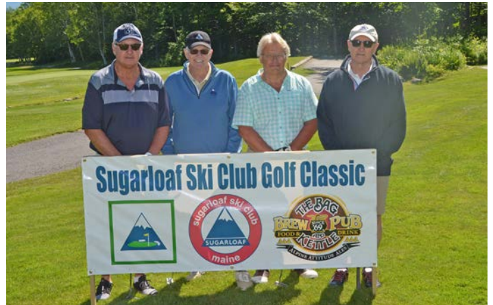
Anderson Insulation has been a loyal supporter of the Sugarloaf Ski Club Golf Classic.