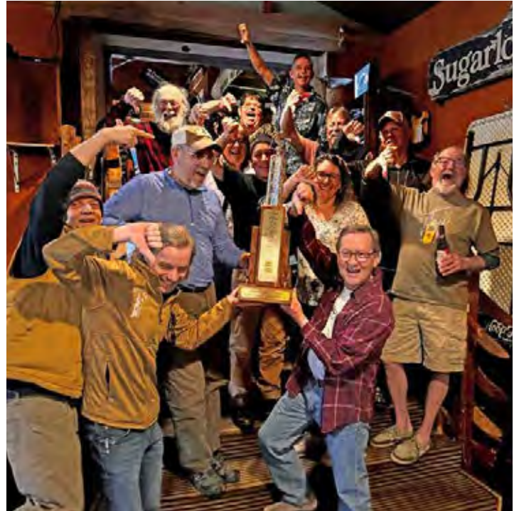
The Rack Locals Team