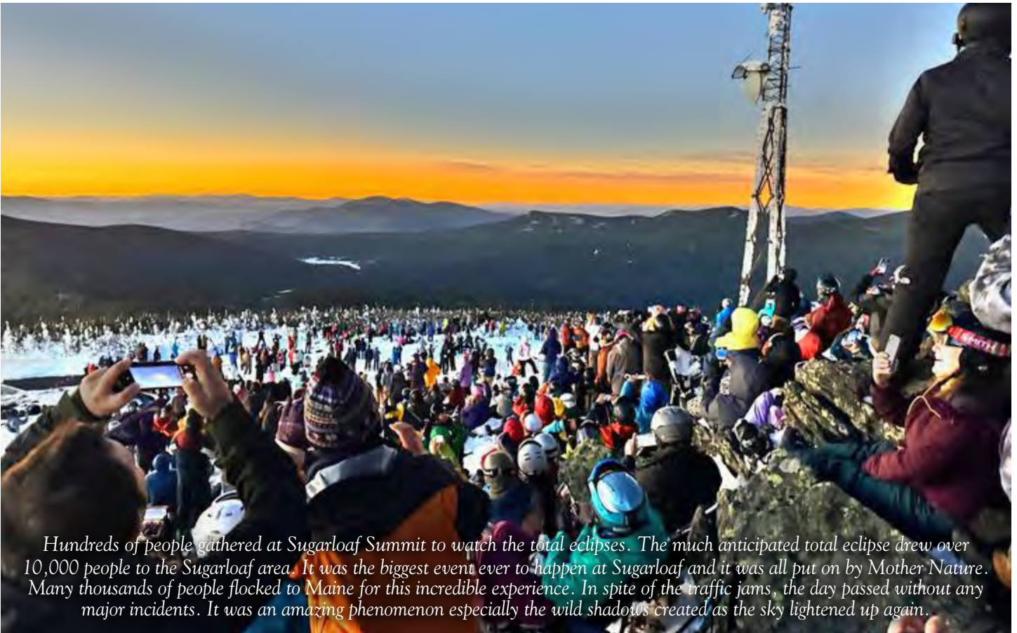
Hundreds of people gathered at Sugarloaf Summit to watch the total eclipses. The much anticipated total eclipse drew over 10,000 people to the Sugarloaf area. It was the biggest event ever to happen at Sugarloaf and it was all put on by Mother Nature. Many thousands of people flocked to Maine for this incredible experience. In spite of the traffic jams, the day passed without any major incidents. It was an amazing phenomenon especially the wild shadows created as the sky lightened up again.