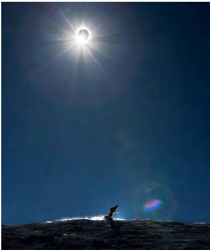
Photographer Jamie Walter captures a snowboarder beneath the total eclipse of April 8.