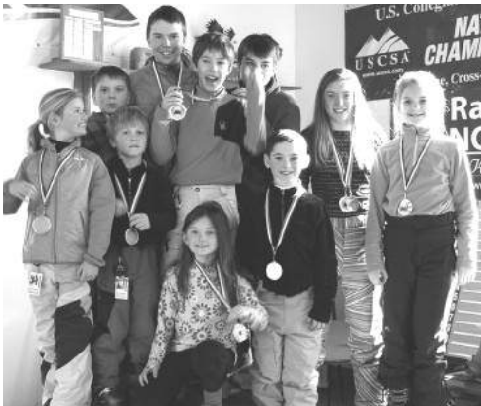
CVA Weekend Program B group mogul competitors are showing some hardware from the Franceour Cup.