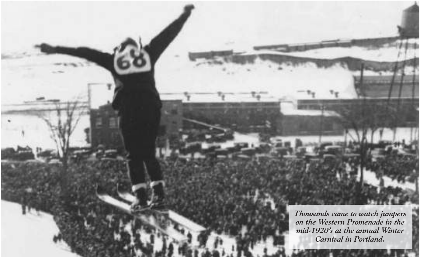
Thousands came to watch jumpers on the Western Promenade in the mid-1920's at the annual Winter Carnival in Portland.

GET $1000 IN FREE SKI TICKETS TO SUGARLOAF MOUNTAIN WHEN WE ARE YOUR BUYER BROKER!