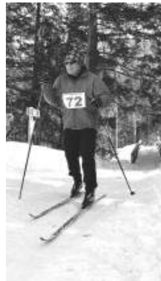
Maine Huts & Trails will host their Seventh Annual Classic Ski Race & Tour, a Point-to-Point Race and Tour on Saturday, March 15, 2015. For more information, go to www.mainehuts.org .

Members-Only Moonlight Snowshoe Learn more at Maine-Huts.org.▲