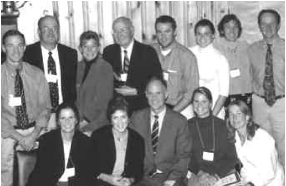
Four generations of Bass Family

To see our current collection of album pages, visit our website: www.sugarloafskiclub.org This ongoing project, with real life and digital albums, documents the loyalty of "Sugarloaf's Skiing Families". Each 3- or 4- generation family (any 5-gen's out there?) will have a page in the album, with one or more photos - on-snow or not, past or present, small groups or large, complete families or not - and text such as photo captions, the names of each generation's Sugarloafers, and dates. Dig through your photos, and add your family to our albums. Send your photos and family information to the Ski Club - by email to sugarloafskiclub@roadrunner.com , or by USPS to Sugarloaf Ski Club, Village West #13, Carrabassett Valley, ME 04947, or deliver them to the Ski Club office.